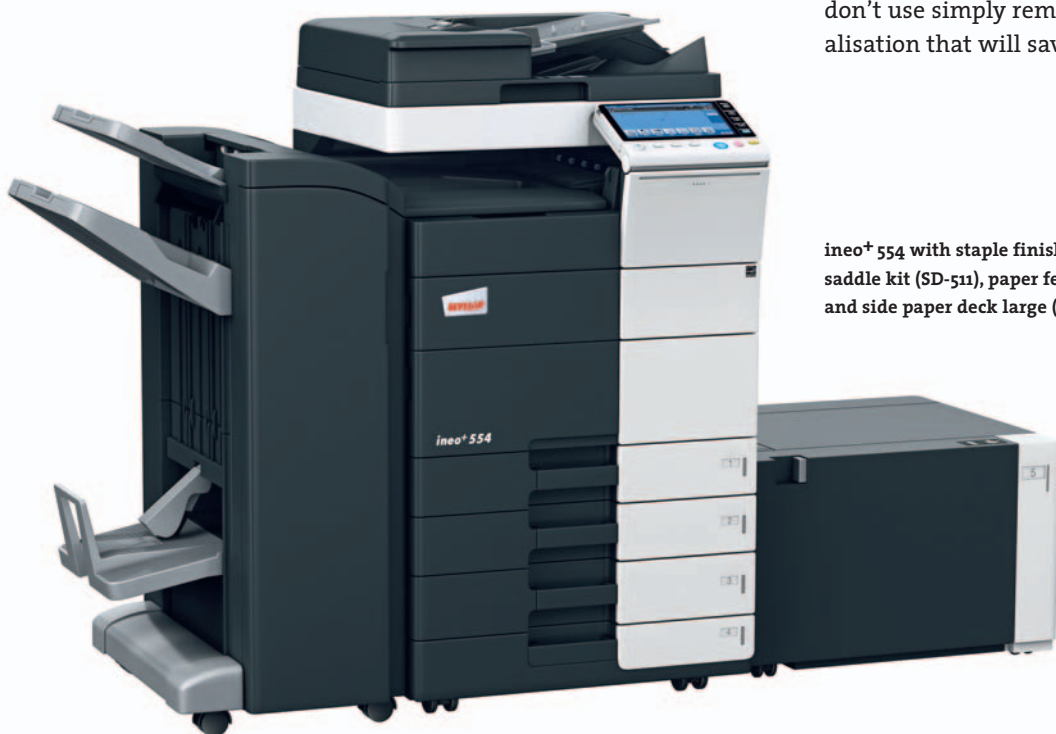
ineo+ 554 with staple finisher (FS-534), saddle kit (SD-511), paper feeder (PC-210) and side paper deck large (LU-204)

Many multifunctional office systems are anything but user-friendly. The ineo+ 554, in contrast, is simplicity itself. An intuitive, easily understandable operating concept ensures that it is as easy to use as your smartphone or tablet. The 9-inch capacitive touchscreen comes with well-known functions such as drag and flick, and thanks to a new menu navigation structure you can see all functions in one go and select the settings you want with just a few clicks. Frequently used functions can be left on the start screen and ones you don't use simply removed. This is the kind of individualisation that will save you lots of time.