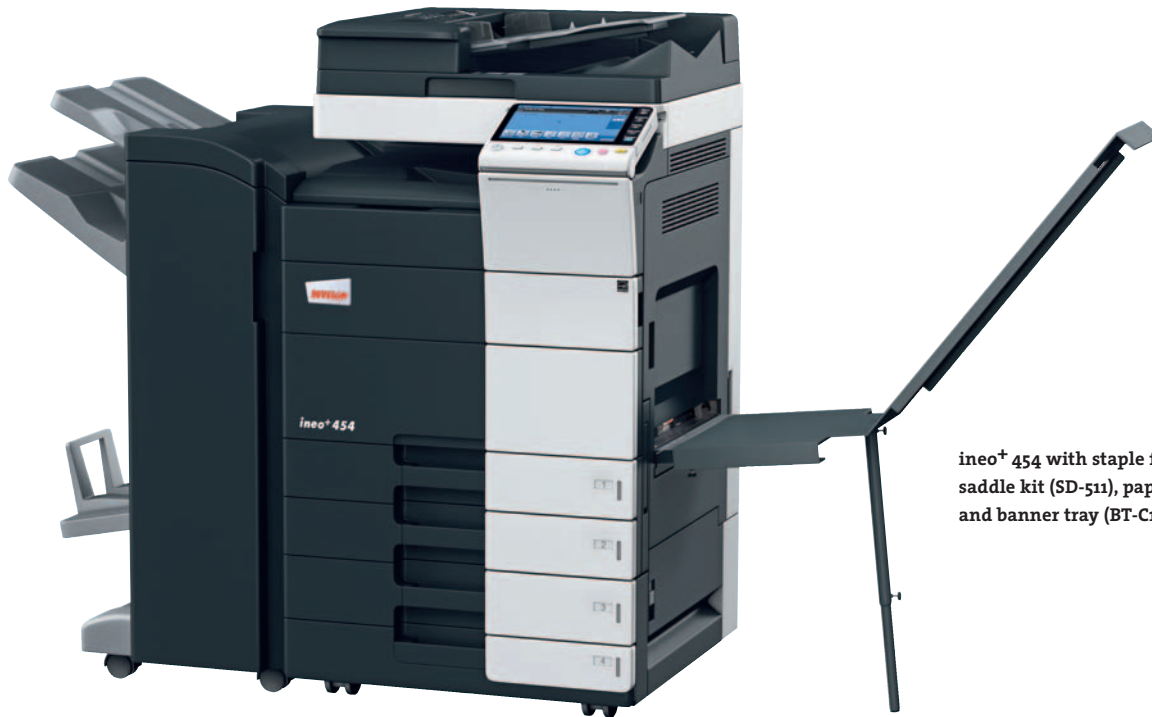
ineo+ 454 with staple finisher (FS-534), saddle kit (SD-511), paper feeder (PC-210) and banner tray (BT-C1e)